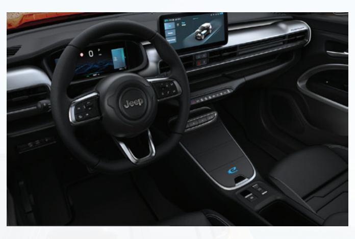
Black Leather Trimmed Bucket Seats ALX9 - Standard