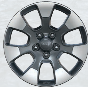
WGB - 18-Inch Tech Gray Diamond Cut Wheels (Standard on Overland)