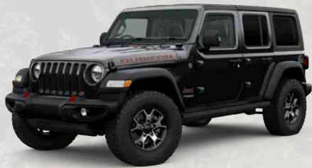
PX8 - Black (Standard)