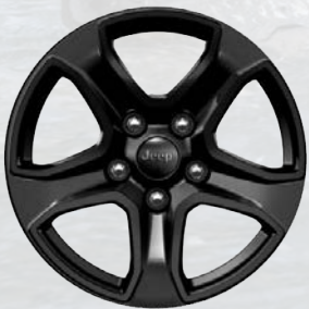
WK3 - 17-Inch Painted Aluminium Wheels (Standard on Night Eagle)