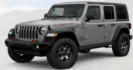
PDN - Sting Grey (Option)