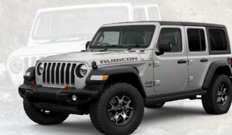
PSE - Silver Zynith (Option)