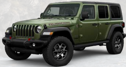
PGG - Sarge (Option)