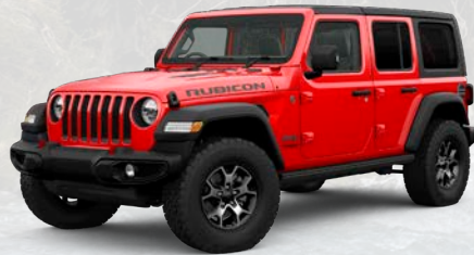
PRC - Firecracker Red (Option)