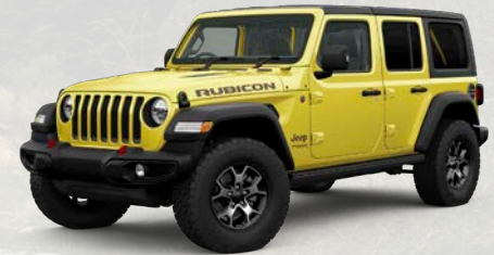
PJF - High Velocity