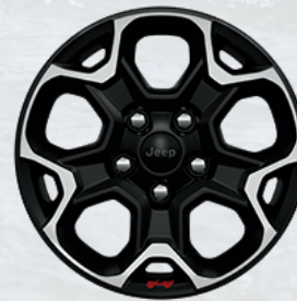
WGQ- 17-Inch Machined Black Painted Wheels