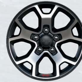
WGM - 17-Inch Polished Wheels with Black Pockets (Option on Rubicon - P/w Trail ready package)