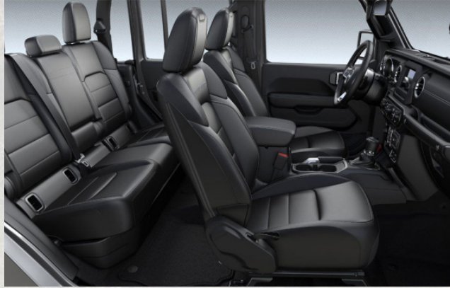
MLX9 - Black McKinley Premium Leather with Overland Logo (Standard - Overland)