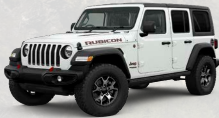
PW7 - Bright White (Standard)