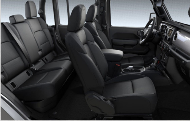
A7X9 - Black Cloth (Standard - Night Eagle)