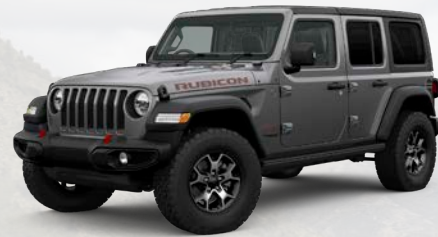
PAU - Granite Crystal (Option - N/A on Overland)