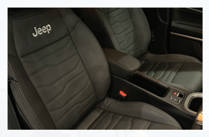
Black Leather Trimmed Bucket Seats ALX9 - Standard