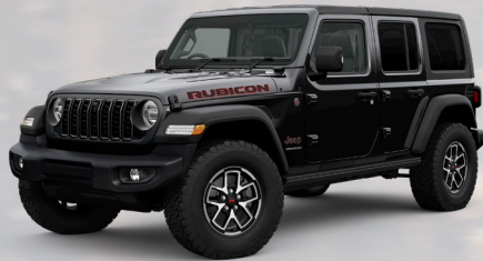
PX8 - Black (Option)