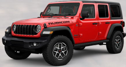
PRC - Firecracker Red (Option)