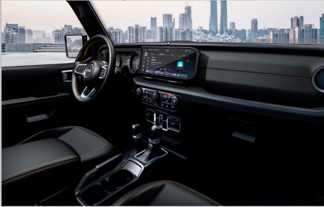
BPX9/NLX9 - Black McKinley Premium (Standard - Overland)