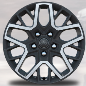
WPA - 18-Inch Machined Painted Grey Wheels (Standard on Overland)