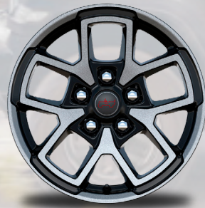
WFV - 17-Inch Machined Painted Black Wheels (Standard on Rubicon)