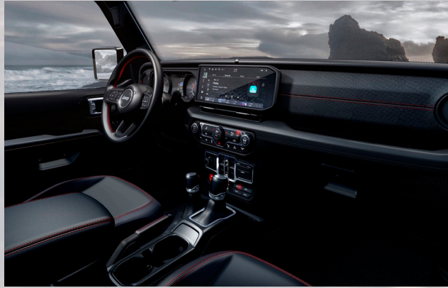
VLX9 - Black Nappa Leather Trimmed Bucket Seats (Standard - Rubicon)