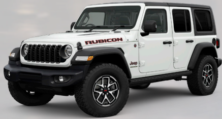
PW7 - Bright White (Standard)