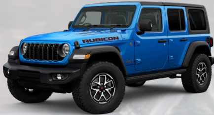
PBJ - Hydro Blue (Option)