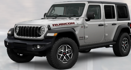
PSE - Silver Zynith (Option)