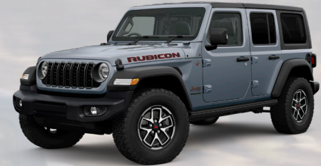
PDS - Anvil (Option)