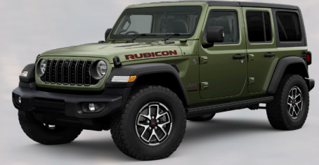
PGG - Sarge (Option)