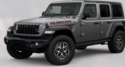
PAU - Granite Crystal (Option)